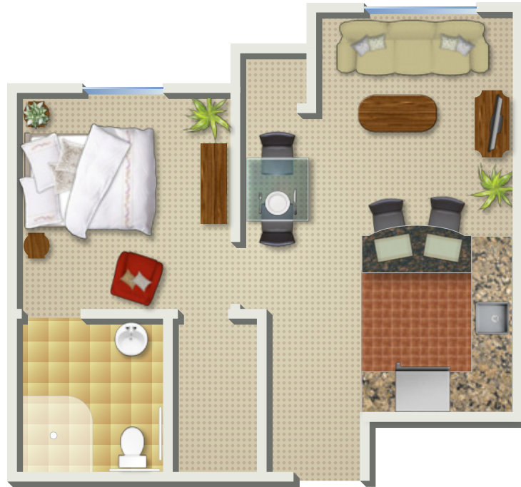
Assisted Living Suite Type: Chestnut at 533 sq ft.